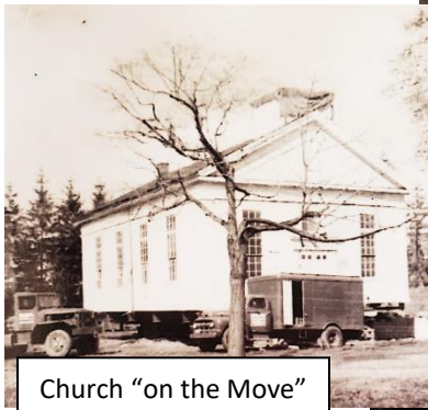
Church "on the Move"