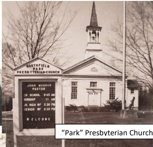
"Park" Presbyterian Church