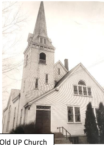
Old UP Church

Following our worship service today, everyone is welcome to attend the 190 th Anniversary reception in the Family Area. There are photos and memorabilia items available in the family area which will serve as a reminder of the many faithful members who contributed to this church's ministry and mission over this 190-year period.